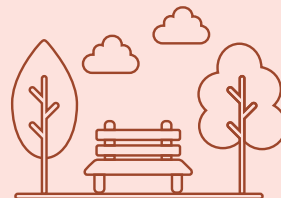
Small community infrastructure