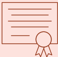
Community training or skills workshops