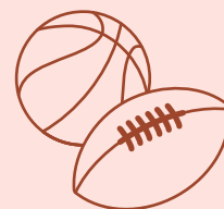
Purchase of local sports team uniforms or equipment