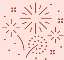
Cultural or community celebration days